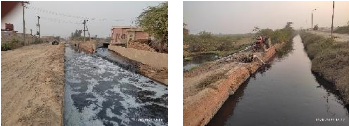
Figure 1-2: Channel 4 near Pumping Station 36 and wastewater pumped from Channel 4

A primary component of the inlet to the proposed WWTP is an open channel known as Channel 4. This transports domestic wastewater and wastewater from textile industries. Currently farmers extract this polluted water for irrigation of crops. This practice is unsanitary. To prevent its continuation, the Contractor shall cover the channel to prevent future access. The Contractor shall design the means of covering the channel within the design phase of the works and shall provide for ventilation of off-gases. The Contractor shall install the cover to the channel and shall be liable for the continued use of the channel during its construction.