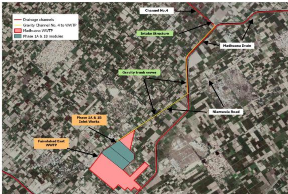
Figure 3: Showing location of proposed WWTP, Channel 4 & Trunk Sewer